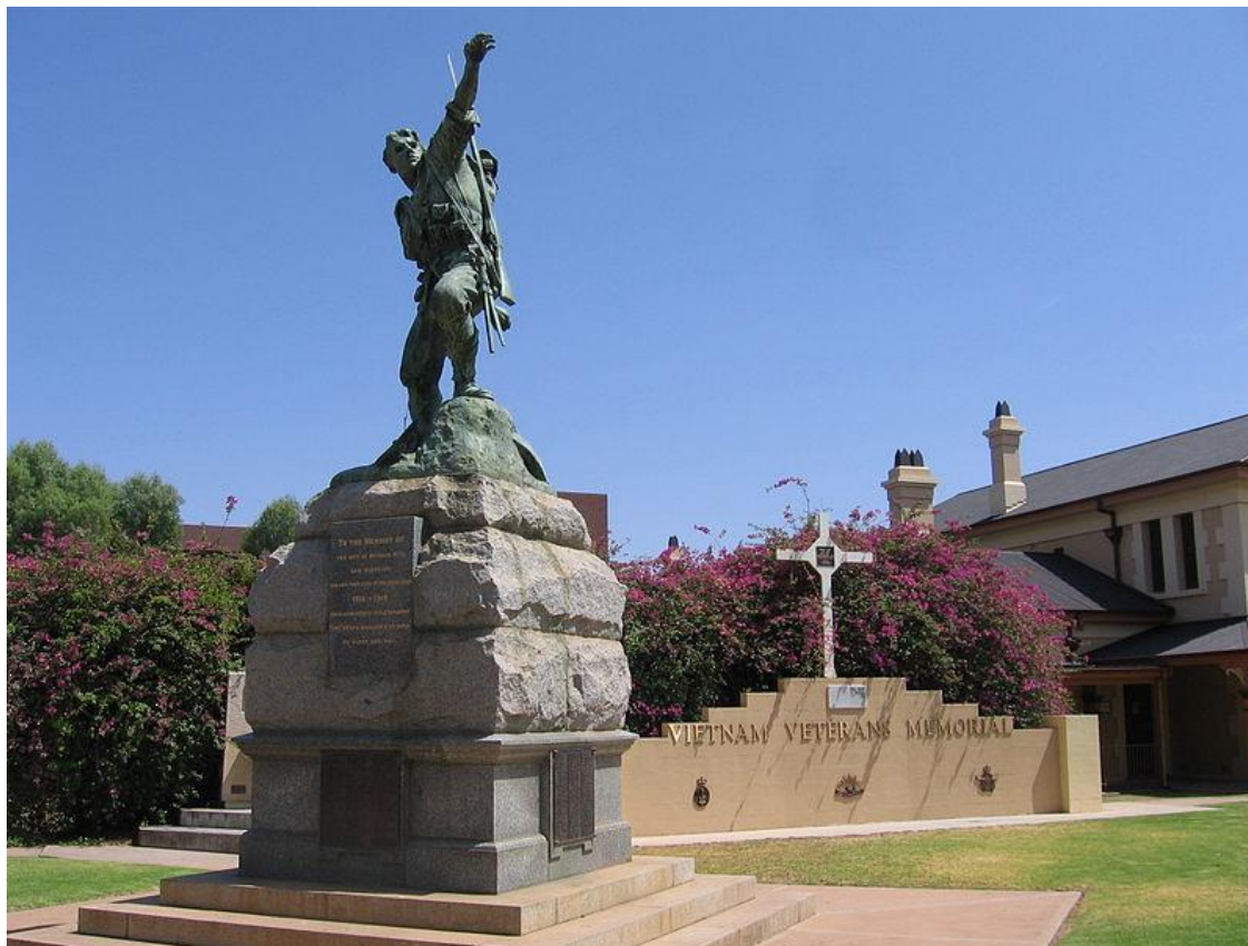
Broken Hill War Memorial