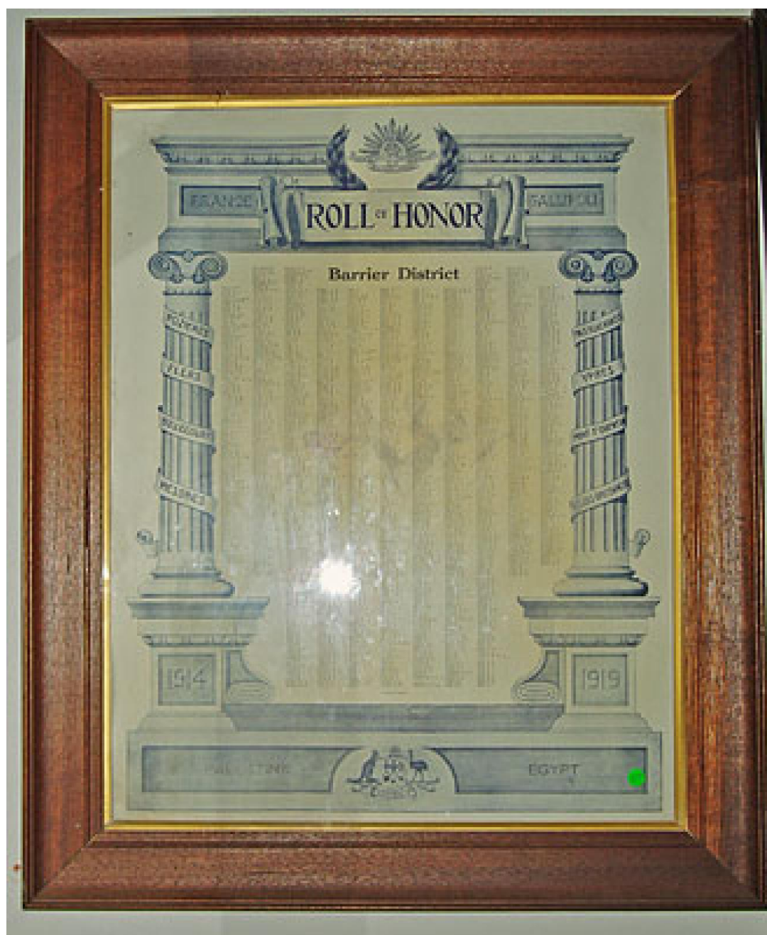
Barrier District Roll of Honour